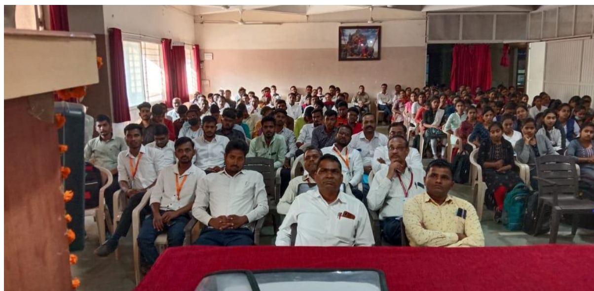
Participants for the Workshop.